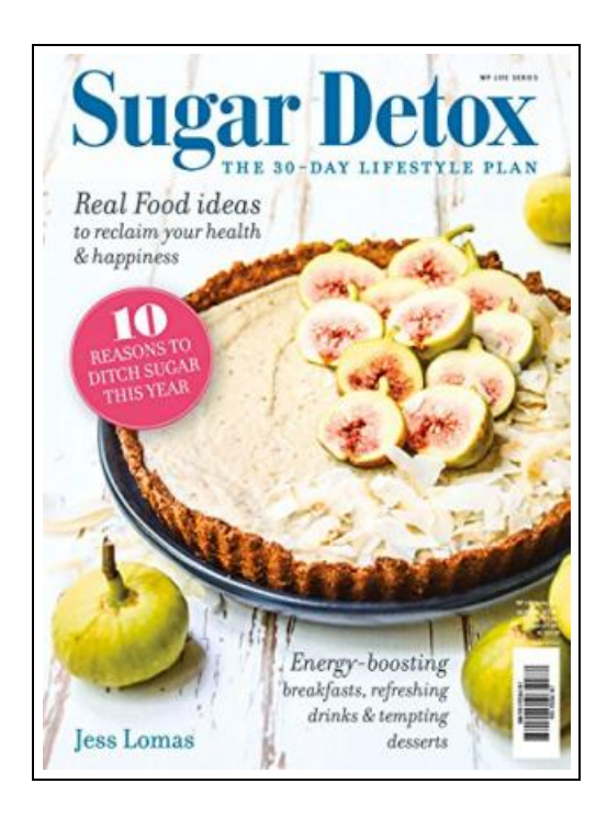
Filesize: 7 MB